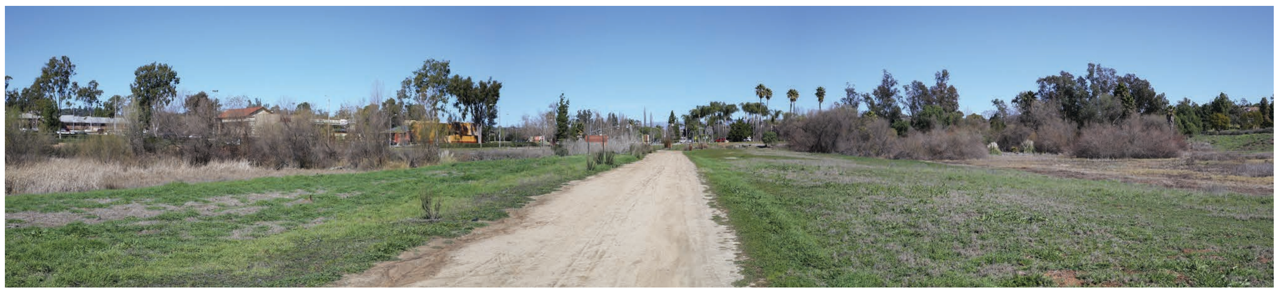
Existing view looking north along Mule Hill Trail near approximate MP 29.4, where the proposed MLV 7 and Line 1600 Cross-tie structure will be located.