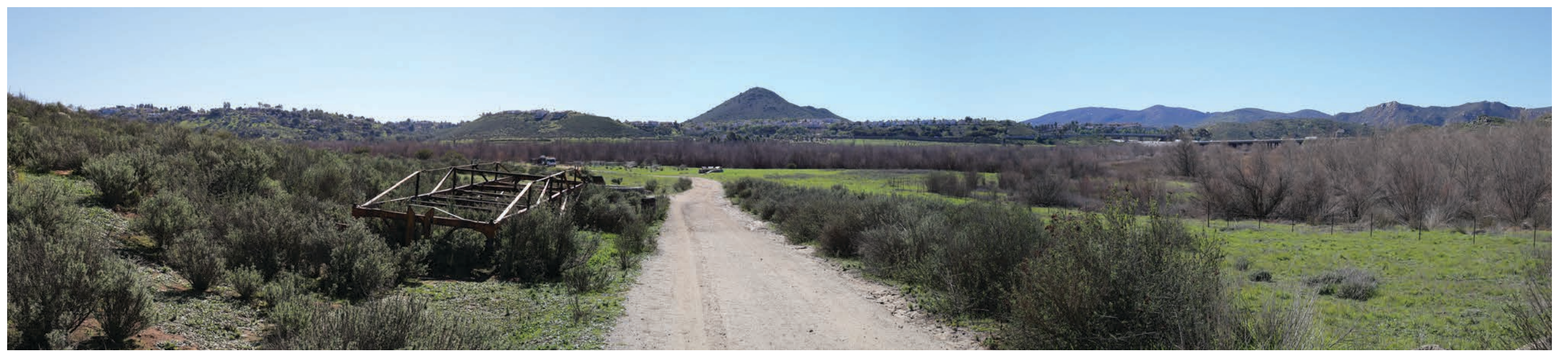
Existing view looking south along Mule Hill Trail near approximate MP 29.7, where the Proposed Project will cross Lake Hodges.