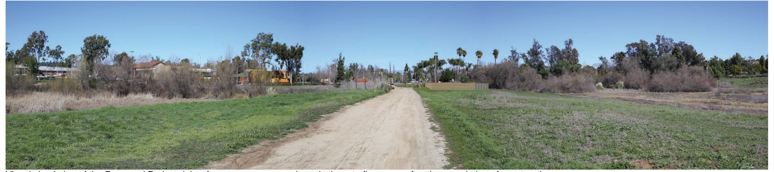
Visual simulation of the Proposed Project right-of-way as seen approximately three to five years after the completion of construction.