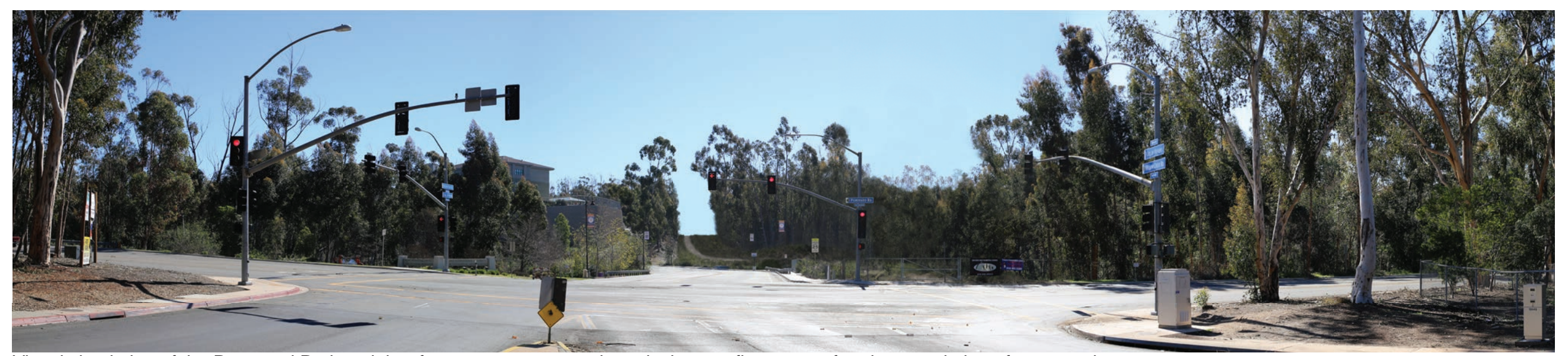
Visual simulation of the Proposed Project right-of-way as seen approximately three to five years after the completion of construction.