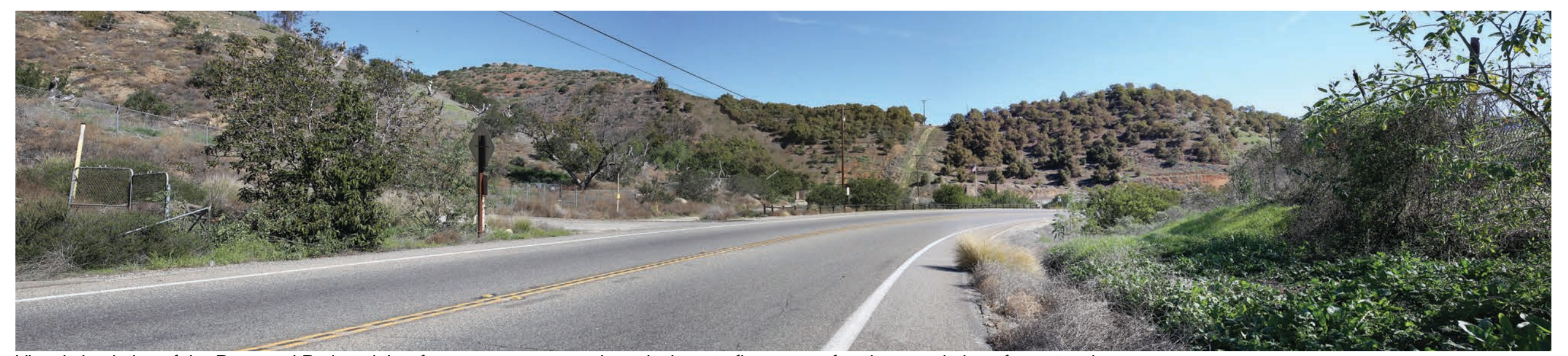
Visual simulation of the Proposed Project right-of-way as seen approximately three to five years after the completion of construction.