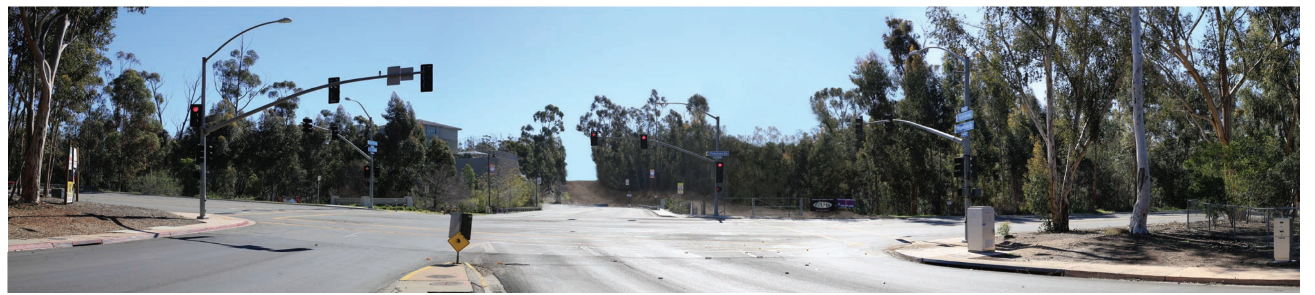
Visual simulation of the Proposed Project right-of-way as seen approximately one year after the completion of construction.