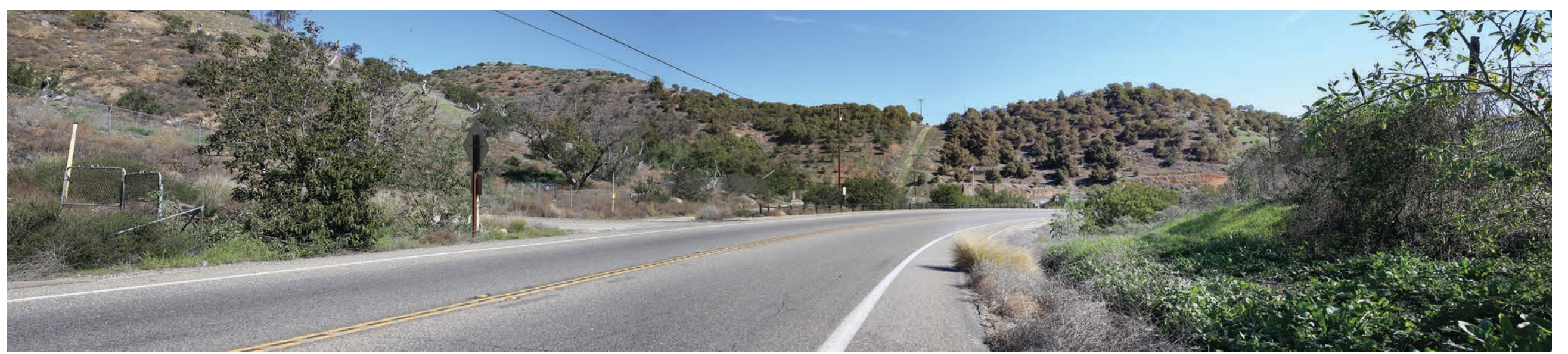
Existing view looking northeast from Mission Road near approximate MP 3.8, where the Proposed Project will travel overland.