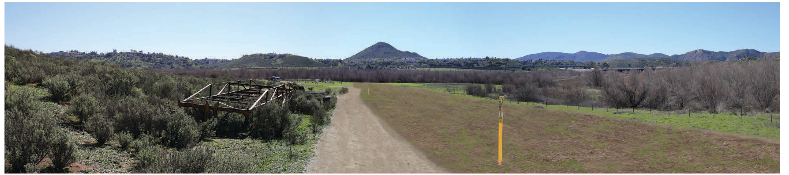
Visual simulation of the Proposed Project right-of-way as seen approximately one year after the completion of construction.