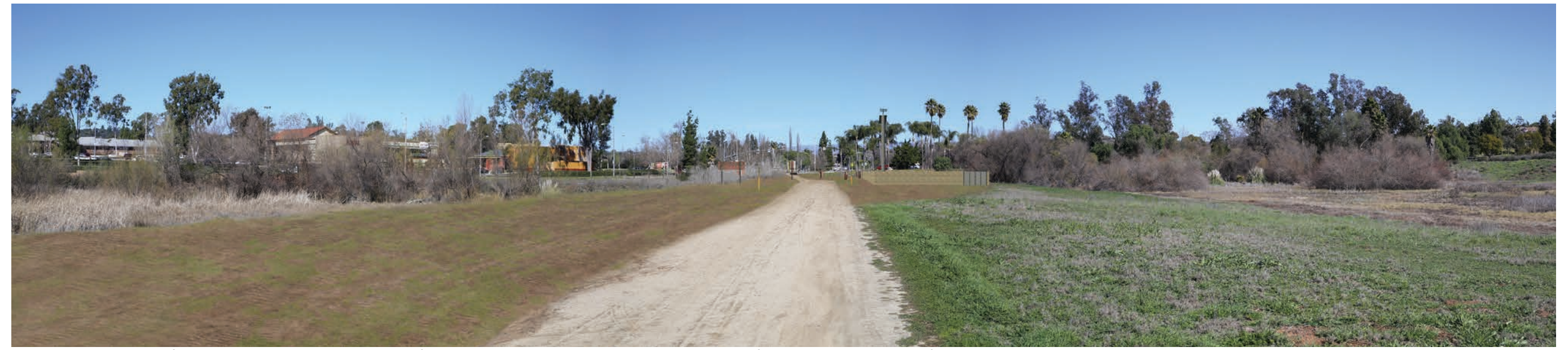
Visual simulation of the Proposed Project right-of-way as seen approximately one year after the completion of construction.