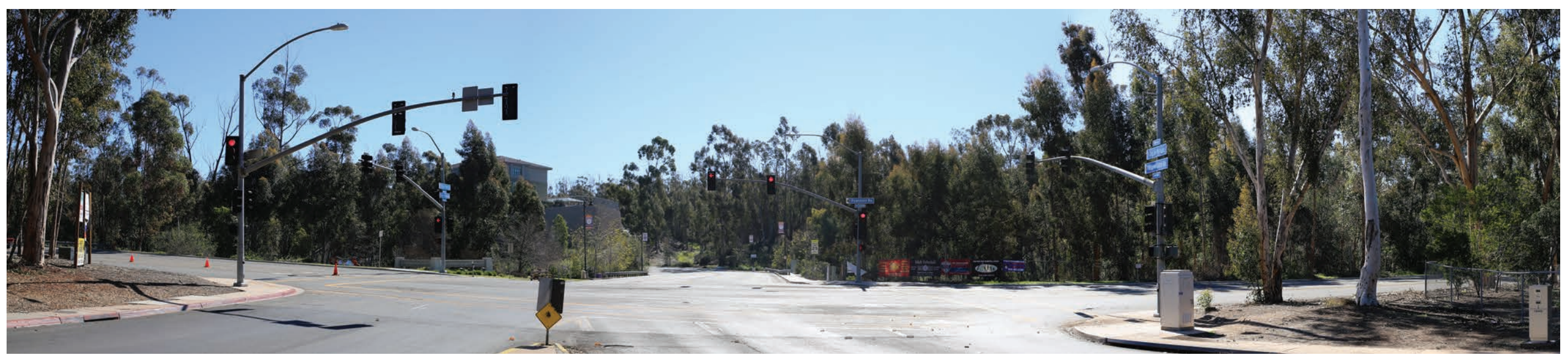
Existing view looking southwest from Willow Creek Road near approximate MP 43.2, where the Proposed Project will turn south near Avenue of Nations.