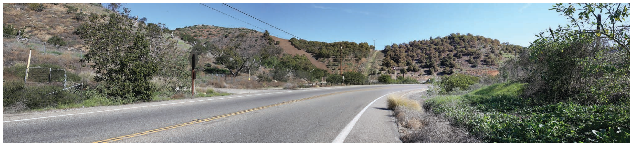
Visual simulation of the Proposed Project right-of-way as seen approximately one year after the completion of construction.