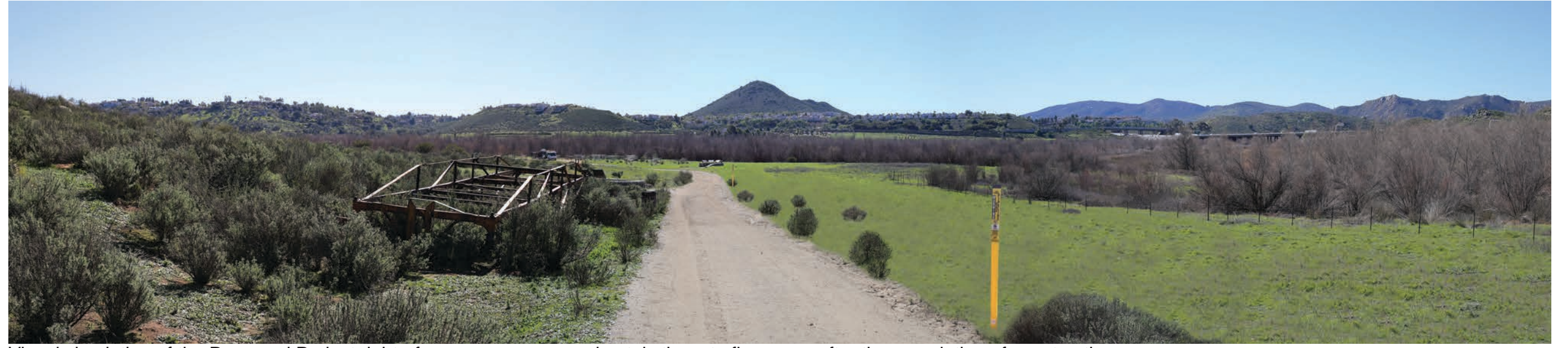
Visual simulation of the Proposed Project right-of-way as seen approximately three to five years after the completion of construction.